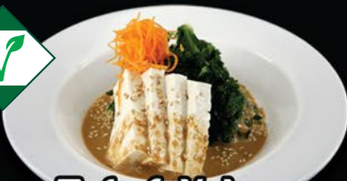
Tofu & Kale Goma-ae $7. 95

Organic Tofu, Kale, House-Made Sesame Sauce, Carrots & Sesame Seeds