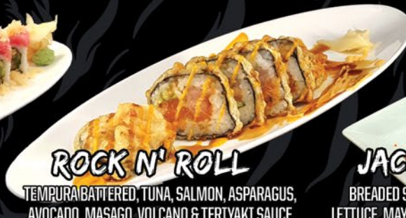
ROCK N' ROLL

AHI TUNA, TEMPURA SHRIMP, AVOCADO, CUCUMBER TEMPURA FLAKES SERVED WITH VOLCANO & TERIYAKI SAUCE