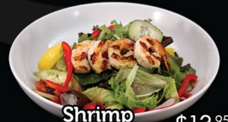
Shrimp Buddha Salad $13. 95