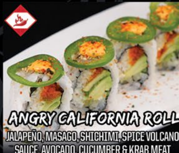
ANGRY CALIFORNIA ROLL

JALAPEÑO, MASAGO, SHICHIMI, SPICE VOLCANO SAUCE, AVOCADO, CUCUMBER & KRAB MEAT