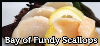
Bay of Fundy Scallops