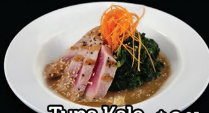
Tuna Kale Goma-ae $9. 95

Organic Tofu, Kale, House-Made Sesame Sauce, Carrots & Sesame Seeds