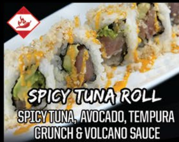
SPICY TUNA ROLL

ATLANTIC SALMON, CUCUMBER, AVOCADO, MASAGO & HURRICANE SAUCE