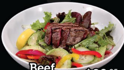
Beef Buddha Salad $20. 95