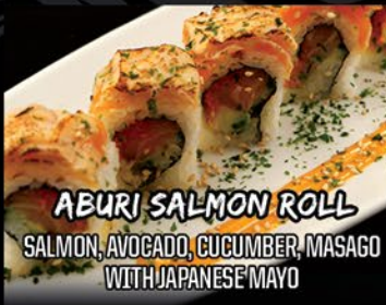
ABURI SALMON ROLL

SALMON, AVOCADO, CUCUMBER, MASAGO WITH JAPANESE MAYO