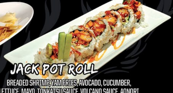
JACK POT ROLL

TEMPURA BATTERED, TUNA, SALMON, ASPARAGUS, AVOCADO, MASAGO, VOLCANO & TERIYAKI SAUCE