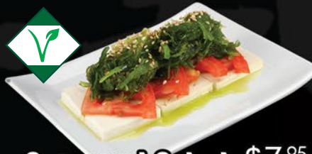
Seaweed Salad $7. 95

Sesame Marinated Kelp, Tofu, Tomato Slices, Sesame Oil, & Sesame Seeds