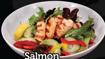
Salmon Buddha Salad $13. 95

Tuna, Salmon, GF House Dressing, Crushed Peanuts, Avocado, Dry Cranberries, Red Radish, Tomato & Carrots