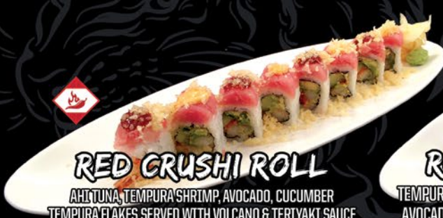
RED CRUSH ROLL

AHI TUNA, TEMPURA SHRIMP, AVOCADO, CUCUMBER TEMPURA FLAKES SERVED WITH VOLCANO & TERIYAKI SAUCE