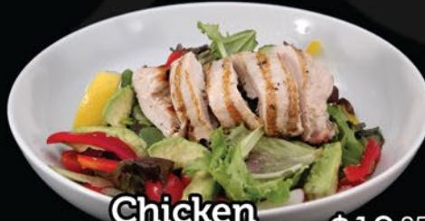
Chicken Buddha Salad $13. 95