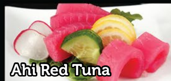
Ahi Red Tuna