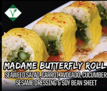
MADAME BUTTERFLY ROLL

GRILLED SALMON, CUCUMBER, TERIYAKI SAUCE, MAYO & BLACK SESAME SEEDS