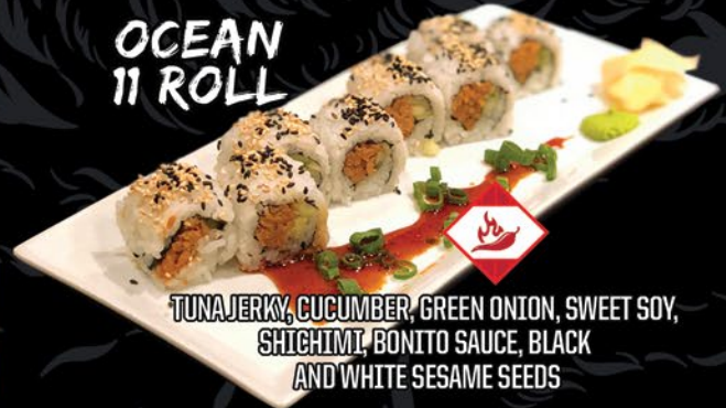
OCEAN 11 ROLL

SEAWEED SALAD, CARROT, AVOCADO, CUCUMBER, SESAME DRESSING & SOY BEAN SHEET