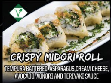
CRISPY MIDORI ROLL

SHRIMP TEMPURA, MASAGO, AVOCADO, CUCUMBER, JAPANESE MAYO & TERIYAKI SAUCE