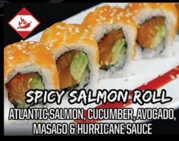
SPICY SALMON ROLL

SALMON, AVOCADO, CUCUMBER, MASAGO WITH JAPANESE MAYO