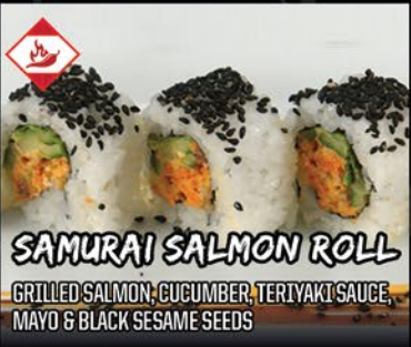
SAMURAI SALMON ROLL

JALAPEÑO, MASAGO, SHICHIMI, SPICE VOLCANO SAUCE, AVOCADO, CUCUMBER & KRAB MEAT